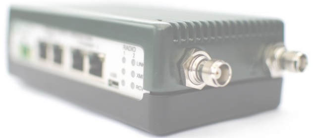
Dimensions (L x W x H): 6.625 " x 3.45 " x 1.835 " / 16.83 cm x 8.76 cm x 4.66 cm Weight 1.61 lbs / 730 grams